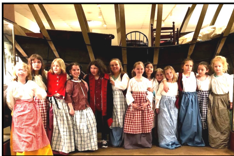
Students from a local Girl Scout Troop model frontier clothing in front of the Conestoga wagon at Campus Martius Museum. Campus Martius received a Marietta Welfare League Community Grant last year to provide clothing for hands-on learning experience.

Our employees and member volunteers know they are making a difference every time the step into The League Shop. We encourage YOU to visit us and see just where the magic happens!